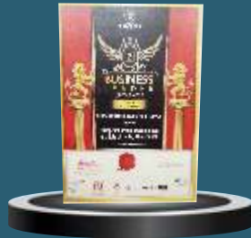
Business leader of the Year Award for Best Academic & Industry Interface 2021