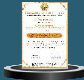
AICTE Lilavati Award 2020 on Women Empowerment (First Runner-Up)